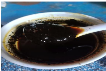
Figure 2. Basil extract ( Ocimum sanctum L)

The total amount of basil extract using 96% ethanol with the maceration method yields 200 grams of basil extract with a yield of 16.67%. The resulting basil extract is served in Figure 2.