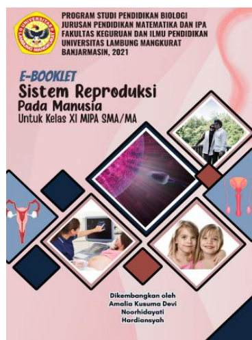
Figure 2. Front Cover of E-Booklet

The E-booklet learning media is designed with the human reproductive system concept taught in class XII of high school. This media is designed to adapt to students' needs, the needs of teachers, the curriculum applied, and the learning objectives that students must achieve. The e-booklet framework developed includes (1) Front Cover; (2) Foreword; (3) Table of Contents; (4) List of images; (5) Instructions for Use; (6) Identity of learning objectives; Indicators of Competency Achievement; Basic competencies; Core Competencies; (7) Material scheduling and Mapping; and (8) Concept maps; (9) Material Introduction; (10) Presentation of Material; (11) Summary; (12) Evaluation Questions; (13) Bibliography; (14) Glossary; (15) Author Profile; and (16) Back Cover. The front cover and back cover can be seen in figures 2 and 3.