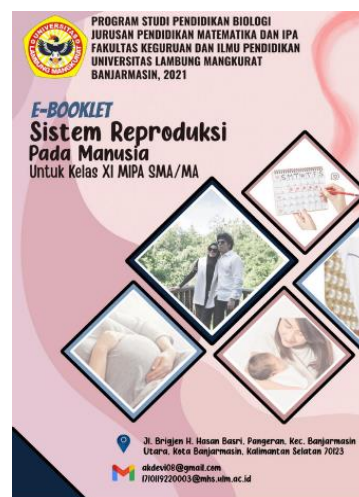
Figure 3. Back Cover of E-Booklet

The feasibility test assessment is carried out by supervisors 1 and 2 from Biology Education PMIPA FKIP ULM Banjarmasin and one teacher teaching biology class XI MIPA. There are a total of 15 aspects that become the benchmark for assessment in the e-booklet feasibility test, which includes aspects of (1) Completely compiled E-Booklet; (2) Availability of additional material following the concept; (3) E-Booklets can be used repeatedly; (4) Requirements available