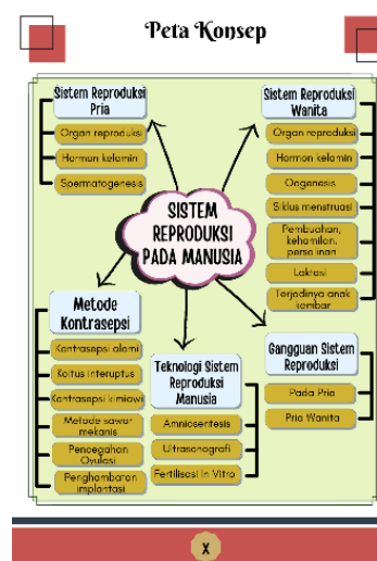
Figure 5. Concept Maps