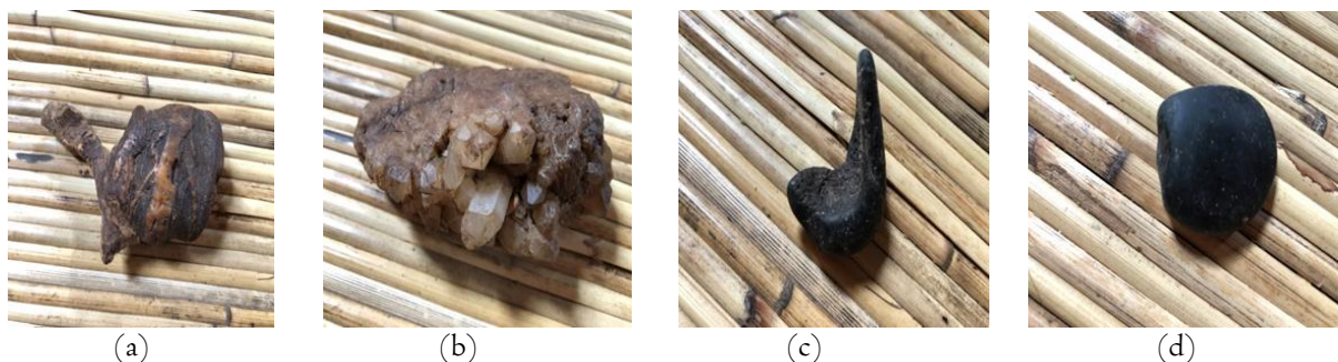
Figure 4. (a) Panulung stone, (b) Lanying stone, (c) Kait stone, (d) Baram stone

The use of stone in Karue Ase rituals in the Dayak Tamambaloh tribe in Bakul Hamlet has meaning. Panulung stone is believed to help the community to get abundant harvests. Lanying stone is believed by the community to prevent the rice from being attacked by pests to produce rice that has good quality. Kait stone is believed by the community to be able to launch windfalls, abundant crops, and full rice barns. Baram stone is believed by the community so that the spirits of the ancestors who inhabit the stone can help harvest rice in the fields. The various stones used during the Karue Ase ritual are presented in Figure 4.