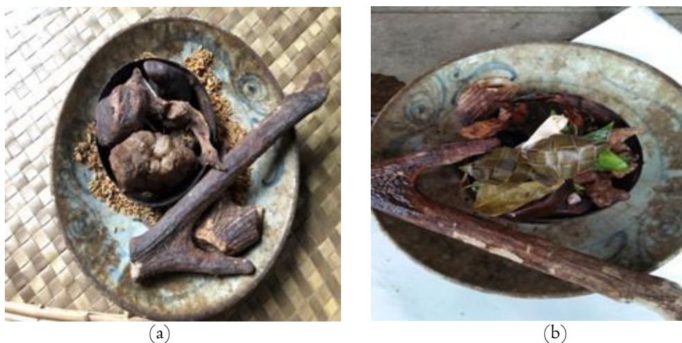
Figure 2. (a) Karue Ase before being given an offering, (b) Karue Ase after being given an offering

Dayak Tamambaloh people in Bakul Hamlet Labian Ira'ang Village, Batang Lupar Subdistrict, Kapuas Hulu Regency, West Kalimantan Province have long used plants, animals, and stones as a medium to carry out Karue Ase traditional rituals. Plants have an important role in ritual, customary, and religious activities in human life (Hidayat, Hikmat, & Zuhud, 2010; Lestari, Ristanto, & Miarsyah, 2019a). The utilization of types of plants in traditional ceremonies gives a message of responsibility for the preservation of plants so that the implementation of traditional ceremonies can continue (Nasution, Chikmawati, Walujo, & Zuhud, 2018). Plants used in traditional ceremonies have a primary function related to symbolic meanings (Iskandar & Iskandar, 2017). Plants used during rituals in the Dayak tribe (including the Dayak Tamambaloh tribe) have philosophical meaning and values. Karue Ase's traditional ritual is found in Figure 2.