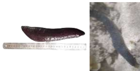
Figure 2. Black Rubber Sea Cucumber ( Holothuria leucospilota )

Holothuria leucospilota Brandt, 1835 (Agusta, 2012)