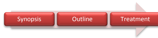
Figure 1. Blueprint of Scriptwriting

characters, writing scenes, and writing moving pictures. Below is the blueprint of scriptwriting based on Ballon (2014).