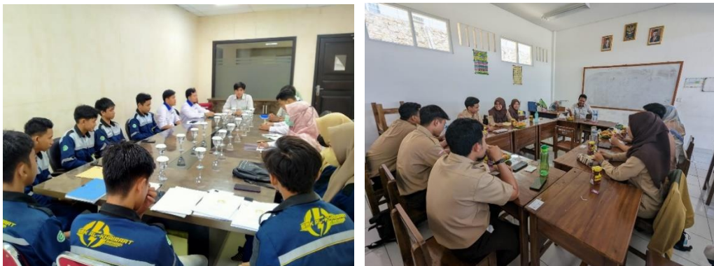
Figure 2. Samples in Classes XI TP1 and XI TP2 at SMKS Alkhairaat Bahodopi

The population in this research case study were students of class XI TP 1 and class XI TP 2 of the Mechanical Engineering program at Alkhairaat Bahodopi Vocational School. The sample in this study as shown in Figure 2, used 10 students in class XI TP 1 students as the experimental group and also 10 students in class XI TP 2 students as the control group.